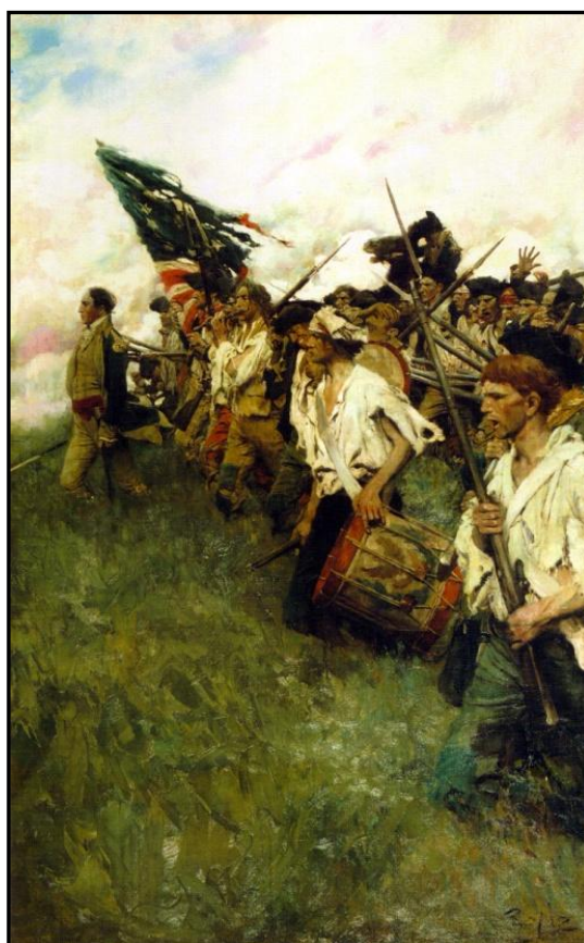
Painting "Nation Makers" by Howard Pyle, currently at Brandywine River Museum, Chadds Ford, PA. Pub before 1911, PD