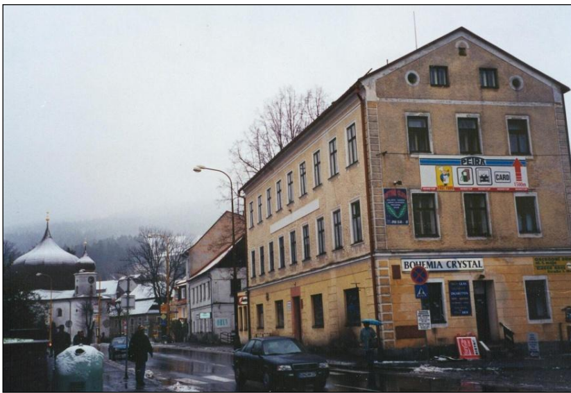
Markt Eisenstein, now Zelezna Ruda, Czech Republic

Today, there are several hiking paths along the Bavarian/Bohemian border which lead through beautiful countryside and past the sites of former glassworks.