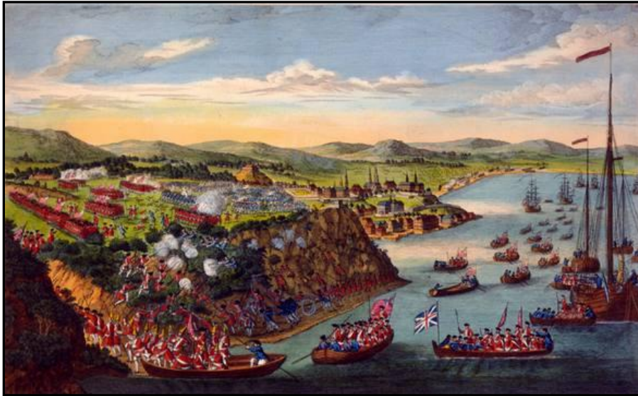
Battle of the Plains of Abraham 1759- This 1797 engraving is based on a sketch made by Hervey Smyth, General Wolfe's aide-de-camp during the siege of Quebec: A view of the taking of Quebec, 13 th September 1759. (Wiki PD)

A Soldier with the Régiment Royal-Roussillon in the French and Indian War (1756-1763)